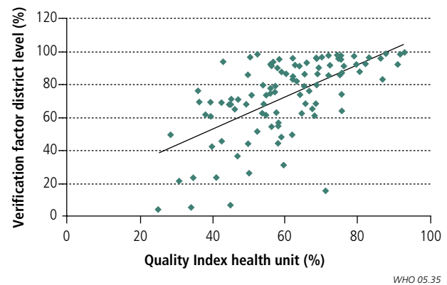
Fig. 3. Correlation between verification factor at the district level and Quality Index score at the health-unit level, from data quality audits, 2002–03

substantive inaccuracies in administrative monitoring systems (11). Coverage surveys are not, however, a substitute for administrative reporting and the timely monitoring of programme effectiveness at the community level. Coverage surveys typically provide information on birth cohorts from previous years and therefore do not provide the continual flow of information needed for local programme management. Coverage surveys also vary in precision, and their data may be subject to recall bias and quality problems (12). Furthermore, they do not provide information on the quality of the monitoring system or identify the cause of inaccuracies. Therefore, administrative monitoring systems are needed to provide critical information on an ongoing basis to local staff in order to determine whether coverage targets are being met. WHO has developed a data quality self-assessment tool (DQS) for use by district-level staff to help them identify problems in their monitoring system. An abbreviated version of the DQS can be integrated into rapid assessments or supportive supervision visits at the district level and health-unit level. In addition, WHO and its partners are promoting the Reaching Every District approach (13), one component of which aims to strengthen district monitoring capacity and to promote the use of local data in planning.